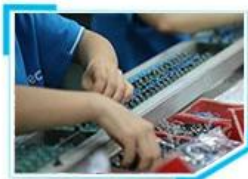
5. Plug in components and parts