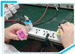
9. Aging test for travel charger