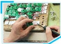
6. Repair welding process