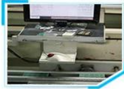
1. Computer programming