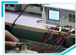
7. PCB board function testing