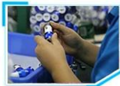
11. Outlook checking