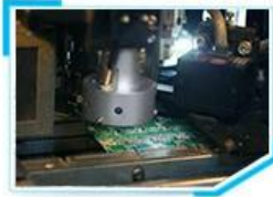
2. Fixing IC and resistors