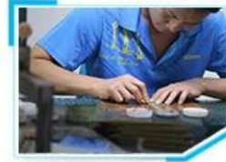
4. PCB QC