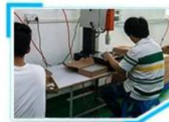
8. Ultrasonic Plastic welding machine